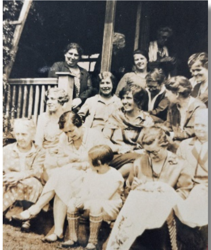
Women's fellowship has served our church for over 120 years!